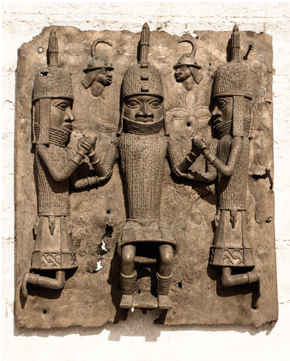
The Oba with Chiefs Osa and Osuan, with Europeans in the background

Oba Palace, Benin City