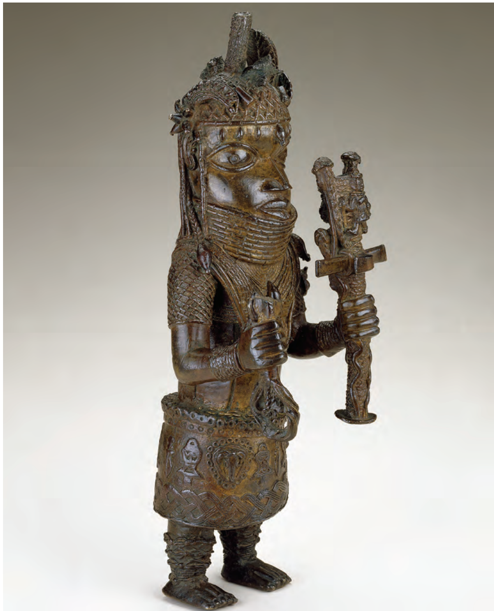
Bronze figure of a king; Benin Kingdom court style; Nigeria, 18th-19th century